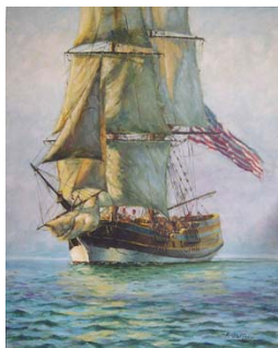
"The Lady Breaks Out of the Fog" by Frank Gaffney (www.frankgaffney.com)